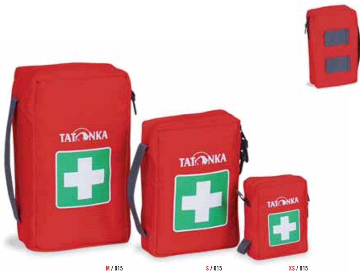
M / 015