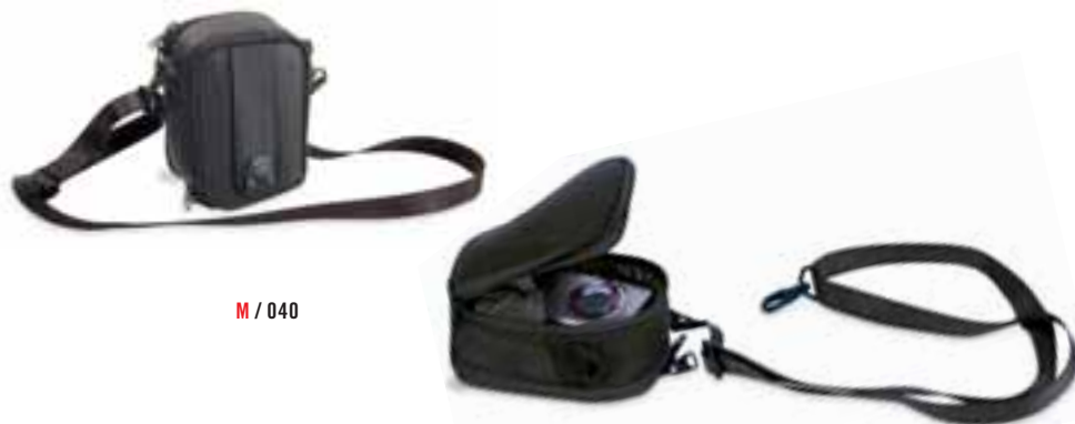
M / 040