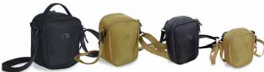
L / 040