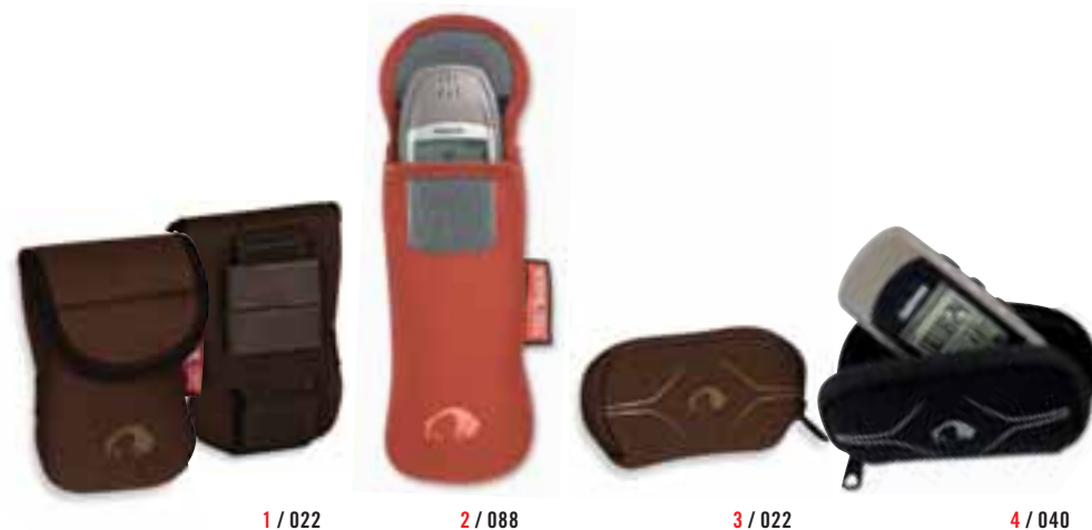
1 / 022

Features: Padded hard foam bag Hypalone belt loop for horizontal or vertical attachment to belt Protective wings on side Mesh insert pocket inside Material: EVA, Snow Crust