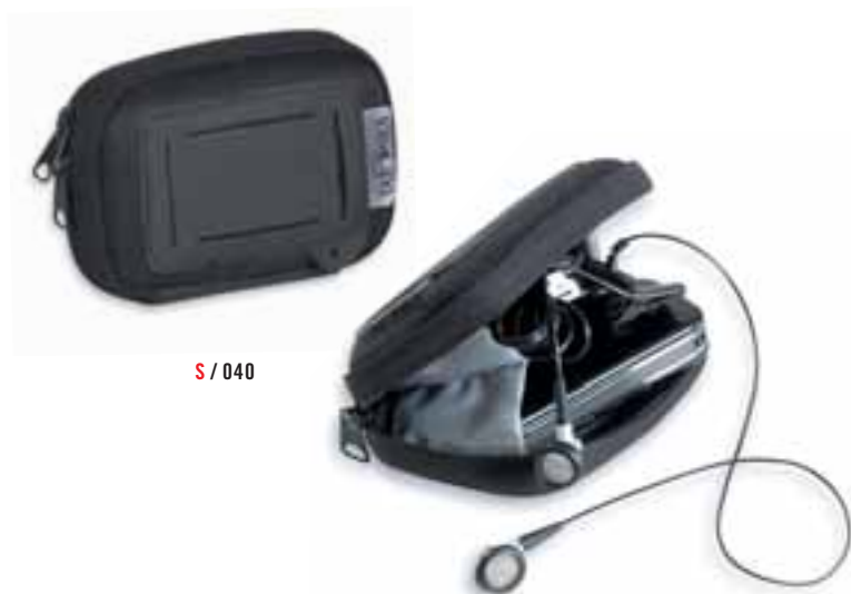
S / 040