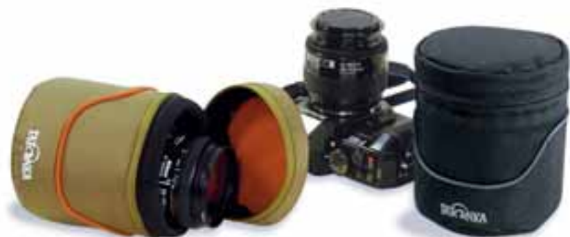
28-210 / 343