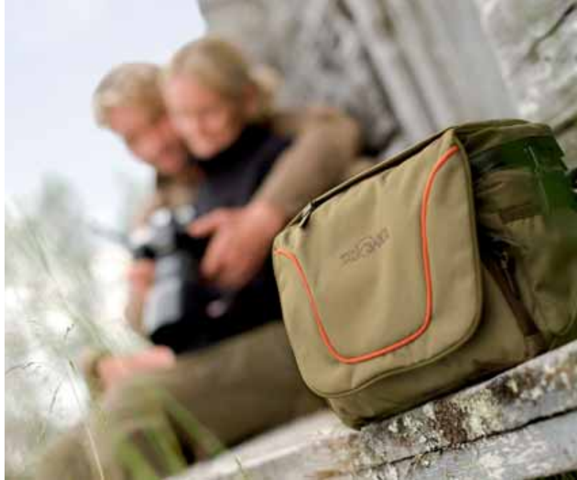
XS / 343