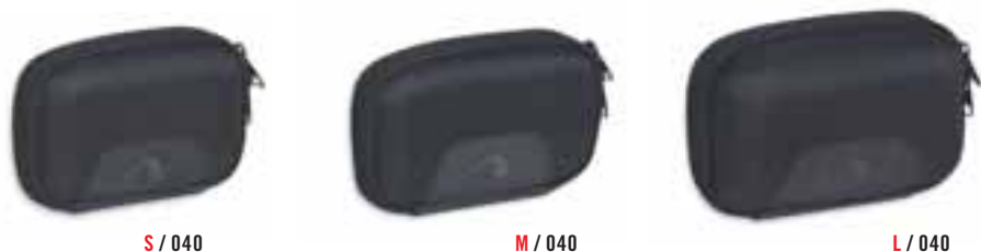
S / 040