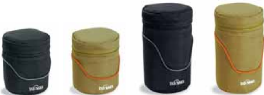
28-210 / 040