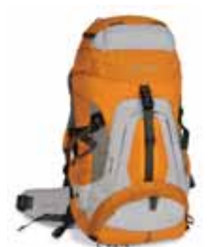
Front view //