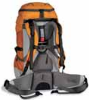
Rear view //